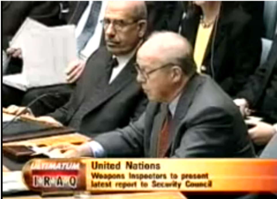
Hans Blix, March 7, 2003

http://www.youtube.com/watch?v=IImVN1dmGuY