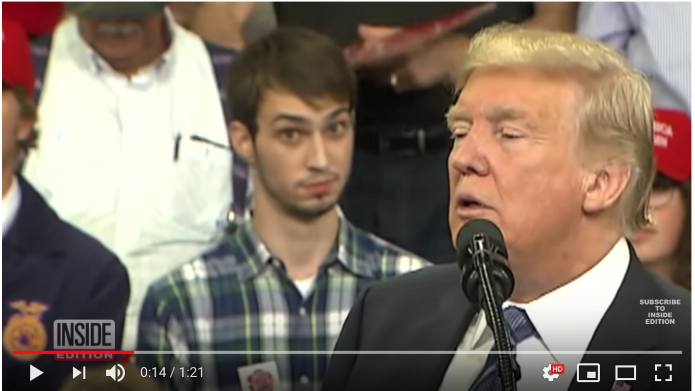
Smirking “Plaid Shirt Guy” upstages Donald Trump, Montana, Sept. 2018. https://www.youtube.com/watch?v=J4pcZdJcpbs