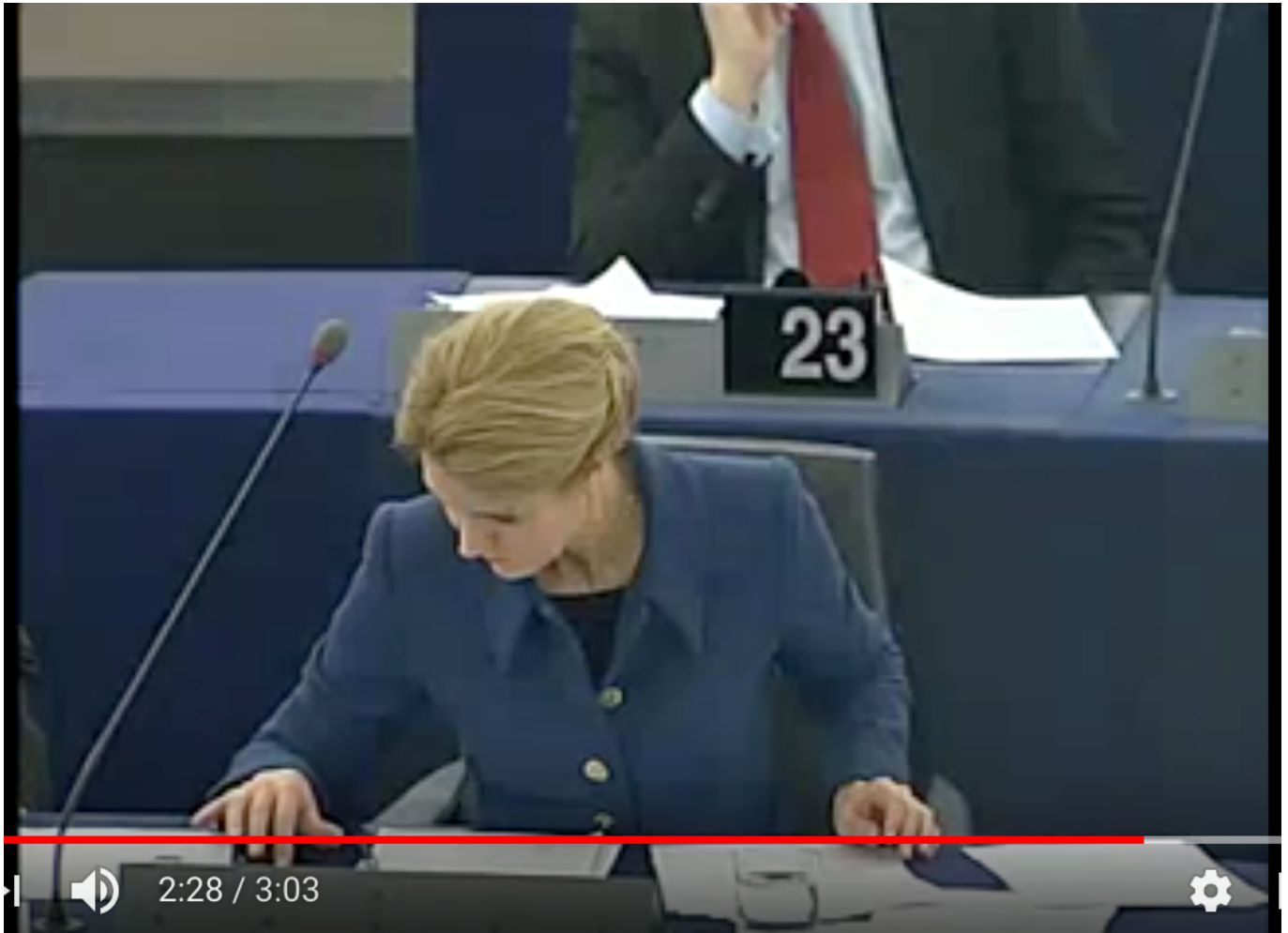
Morten Messerschmidt - Helle Thorning Schmidt (EU-Parliament, Jan.2012). https://www.youtube.com/watch?v=CB063m9aF-g&t=109s