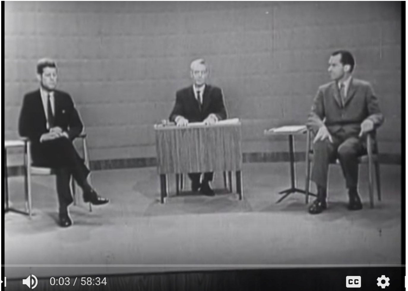
Kennedy versus Nixon 1960 presidential election debate.

Reviewing the black-and-white footage confirms that Nixon does not appear quite as comfortable and statesman like as Kennedy. Nixon's suit is grey, with little contrast to the