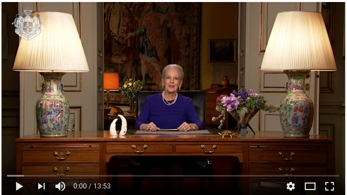
Danish Queen's New Year's address, 2017(-18).

may also offer some slightly moralizing advice, e.g. about how to be kinder to each other. The Danish monarch is not supposed to act as a politician in any ordinary sense, however, the camera work involved in this very ceremonial broadcast may well illustrate how the authority and ethos of a speaker can be supported by the setting and operation of the camera.